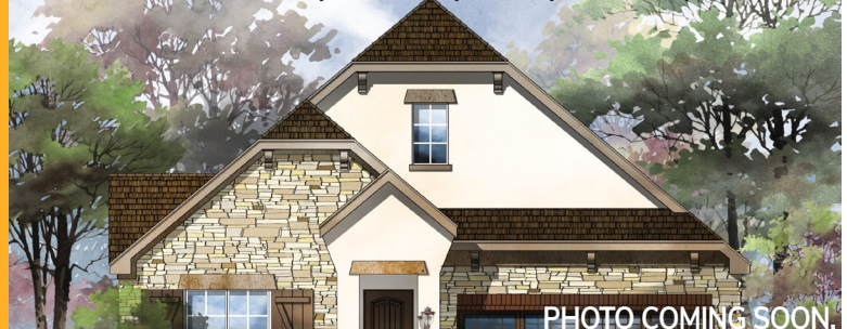
PHOTO COMING SOON.

28302 FRANK TERRACE | $618,558 | 2 BED | 2.5 BATH | 2,368 sq. FT.