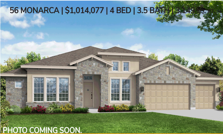
PHOTO COMING SOON.

56 MONARCA | $1,014,077 | 4 BED | 3.5 BATH | 3,149 SQ. FT.